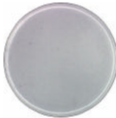
50,000 PBMC per well, non-stimulated

Typical results after 20 hours incubation